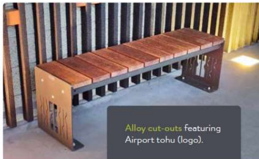
Alloy cut-outs featuring Airport tohu (logo).