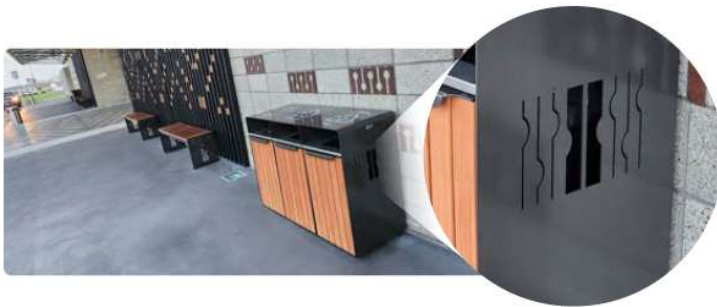
Christchurch City Council – High Street Upgrade – Custom platform benches

Phone 0508 487 226 (Freephone) T +64-6-348 0511 F +64-6-348 9355 E sales@urbaneffects.co.nz 230 Guyton St, Wanganui 4540 NEW ZEALAND