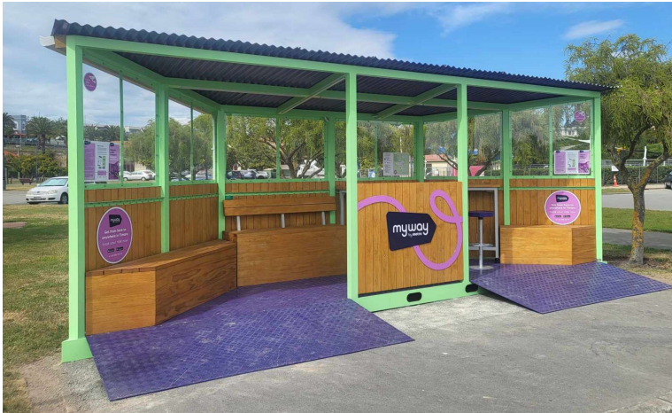
Timaru District Council – Caroline Bay Playground – 2 nd Parklet