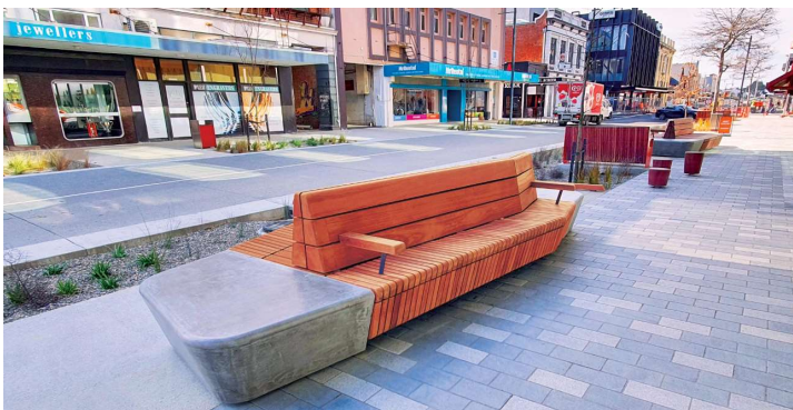
Invercargill City Council – City Streets Upgrades Stage I – Custom Benches