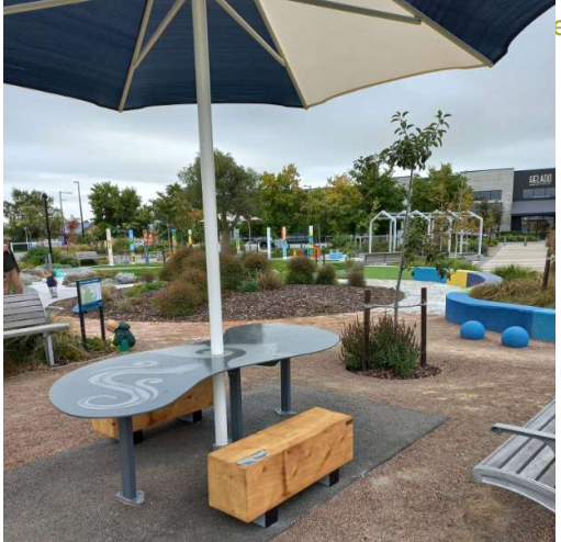
enhancing the urban landscape

Phone 0508 487 226 (Freephone) T +64-6-348 0511 F +64-6-348 9355 E sales@urbaneffects.co.nz 230 Guyton St, Wanganui 4540 NEW ZEALAND