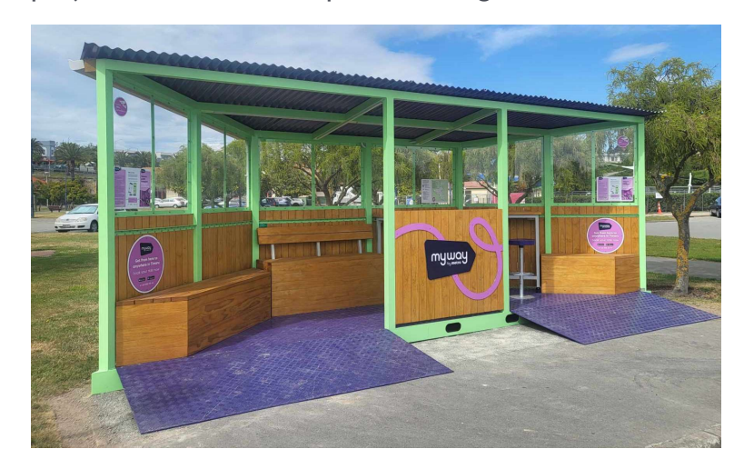
Timaru District Council – Caroline Bay Playground – 2<sup>nd</sup> Parklet

E sales@urbaneffects.co.nz 230 Guyton St, Wanganui 4540 NEW ZEALAND