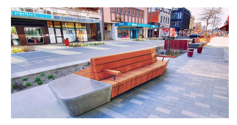
Invercargill City Council – City Streets Upgrades Stage I – Custom Benches