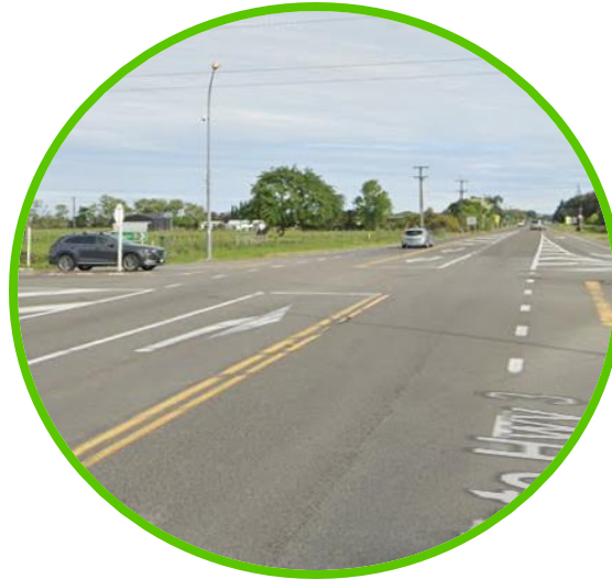
Safety Improvements to SH3/SH54 Intersection