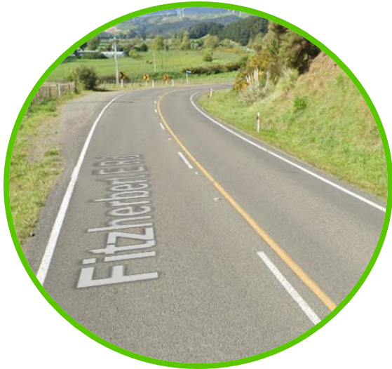
SH 3 & SH 57 Renewals

Subject to confirmation of NLTP funding impacts