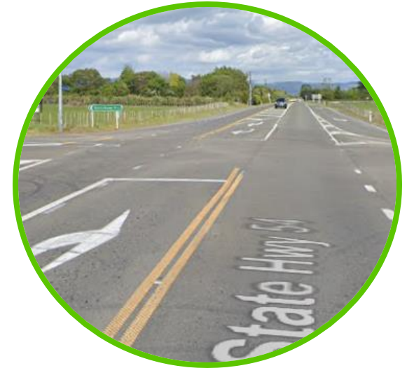
Safety Improvements to SH54/Milson Line Intersection