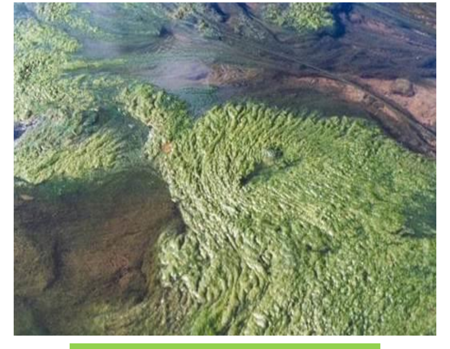
GREEN ALGAE - Periphyton – Boness Road