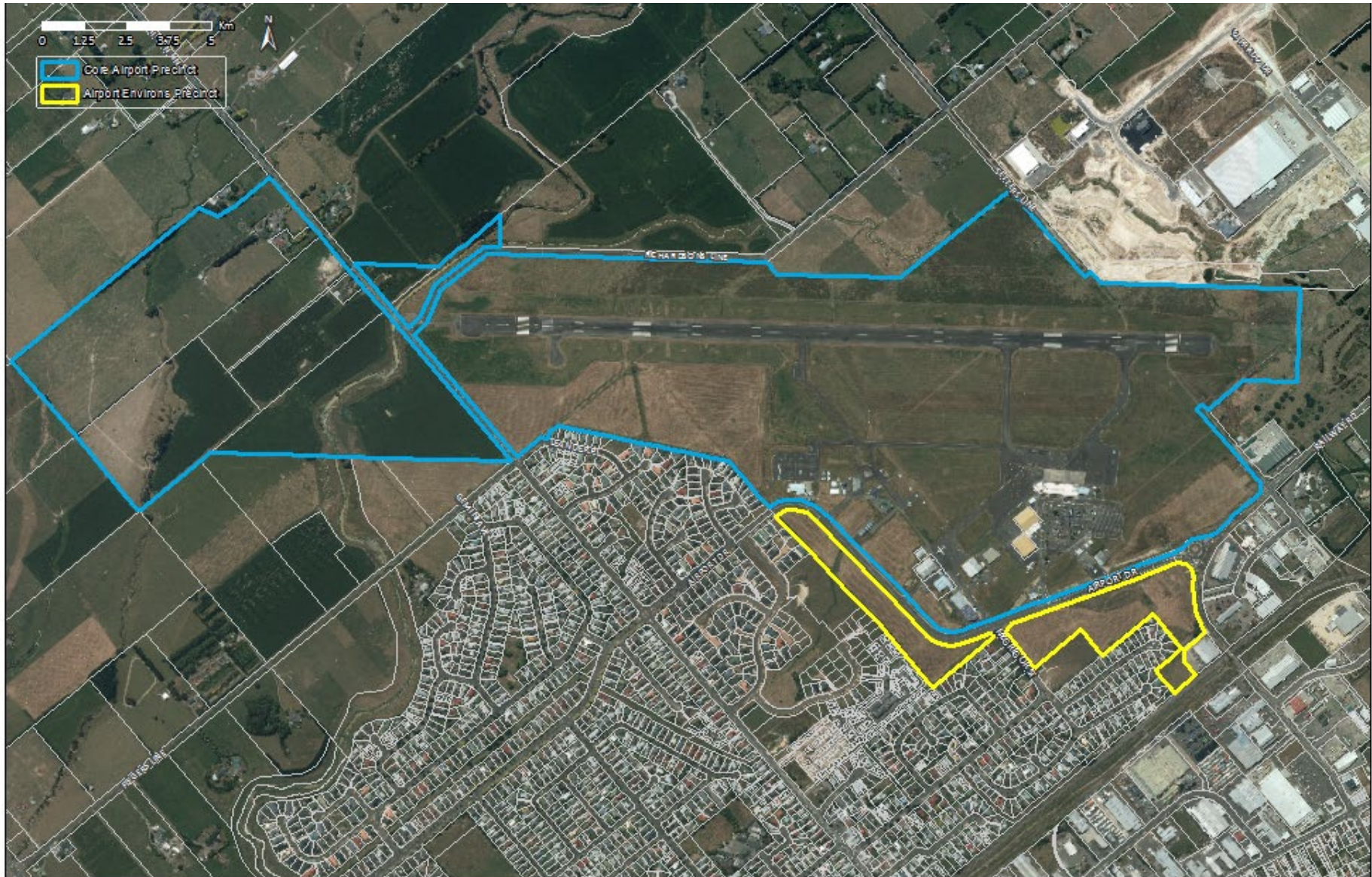
Map 13.1 Airport Zone Precincts