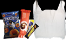
Soft plastics and plastic bags