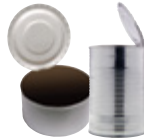
Steel tins + cans