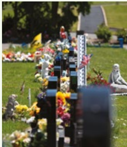
Headstone - for specification see Memorial Application form